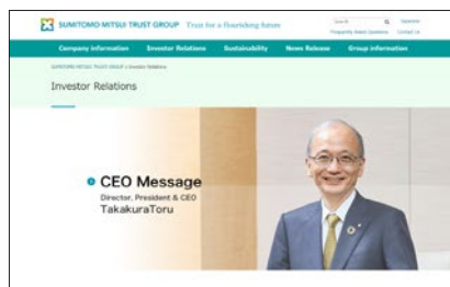
Investor Relations https://www.smtg.jp/english/investors